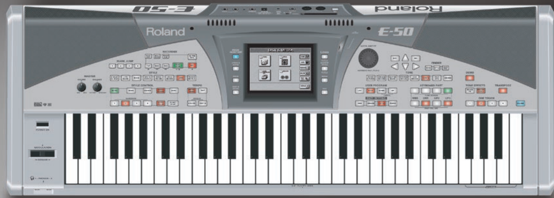
*Product pictured is a prototype model. Actual product appearance may be subject to change.